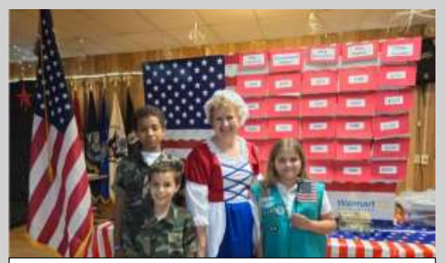
Betsy Ross and 2 Atlantic Coast Young Marines and a Girl Scout at the Flag Day celebration