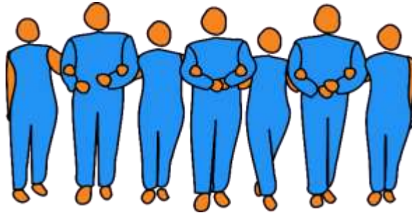
“UNITY” IN OUR COMMUNITY